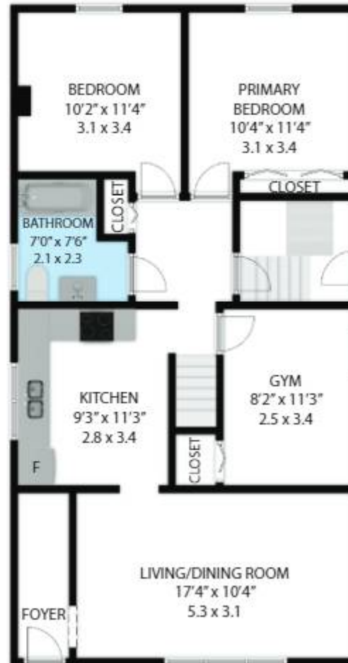
MAIN LEVEL 878 SQ.FT 81 SQ.M

733 Dunn Avenue, Hamilton L8H 6M7 TOTAL APPROX. FLOOR AREA 1,890 SQ.FT 175 SQ.M